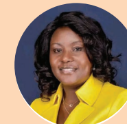
H.E. CECILY MBARIRE, MGH GOVERNOR, EMBU COUNTY