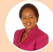
H.E. ANNE WAIGURU, EGH GOVERNOR, KIRINYAGA COUNTY