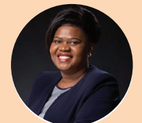
H.E. GLADYS WANGA, CBS GOVERNOR, HOMA BAY COUNTY